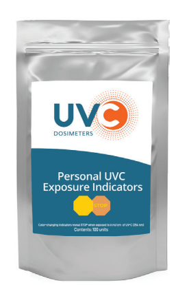
PACKAGING 4.5" x 6.375" resealable bag (design may vary by country)